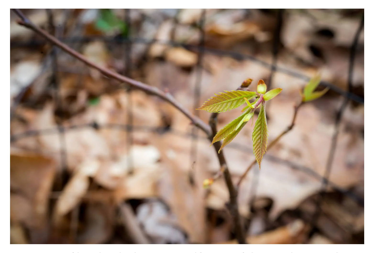
It's a start: This spring, tiny leaves emerged from one of about two dozen American chestnut saplings planted in the fall of 2023. Troy Thompson

About two dozen of the resulting saplings were planted at New England Botanic Garden last October. This spring, 160 nuts went into the ground. Each has been carefully marked and recorded, and protected from predation by animals.