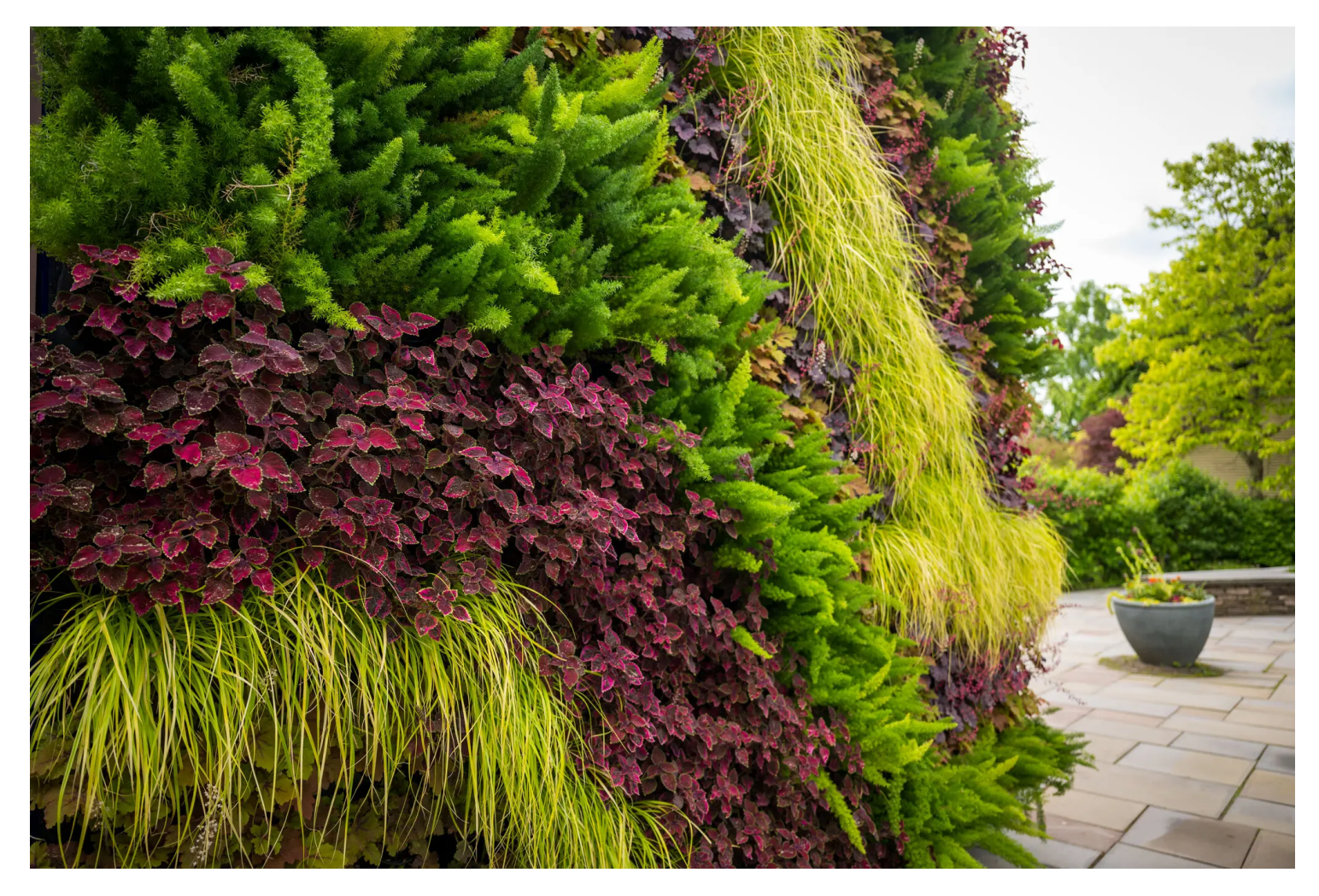
The garden welcomes visitors with a number of splashy displays, including living walls of colorful, textural plants in an area called the Court. New England Botanic Garden

horticultural organizations. The apples honor the society's long agricultural heritage; the chestnuts embody a goal outlined in 2020 in the botanic garden's strategic plan, calling for using the land for conservation research.