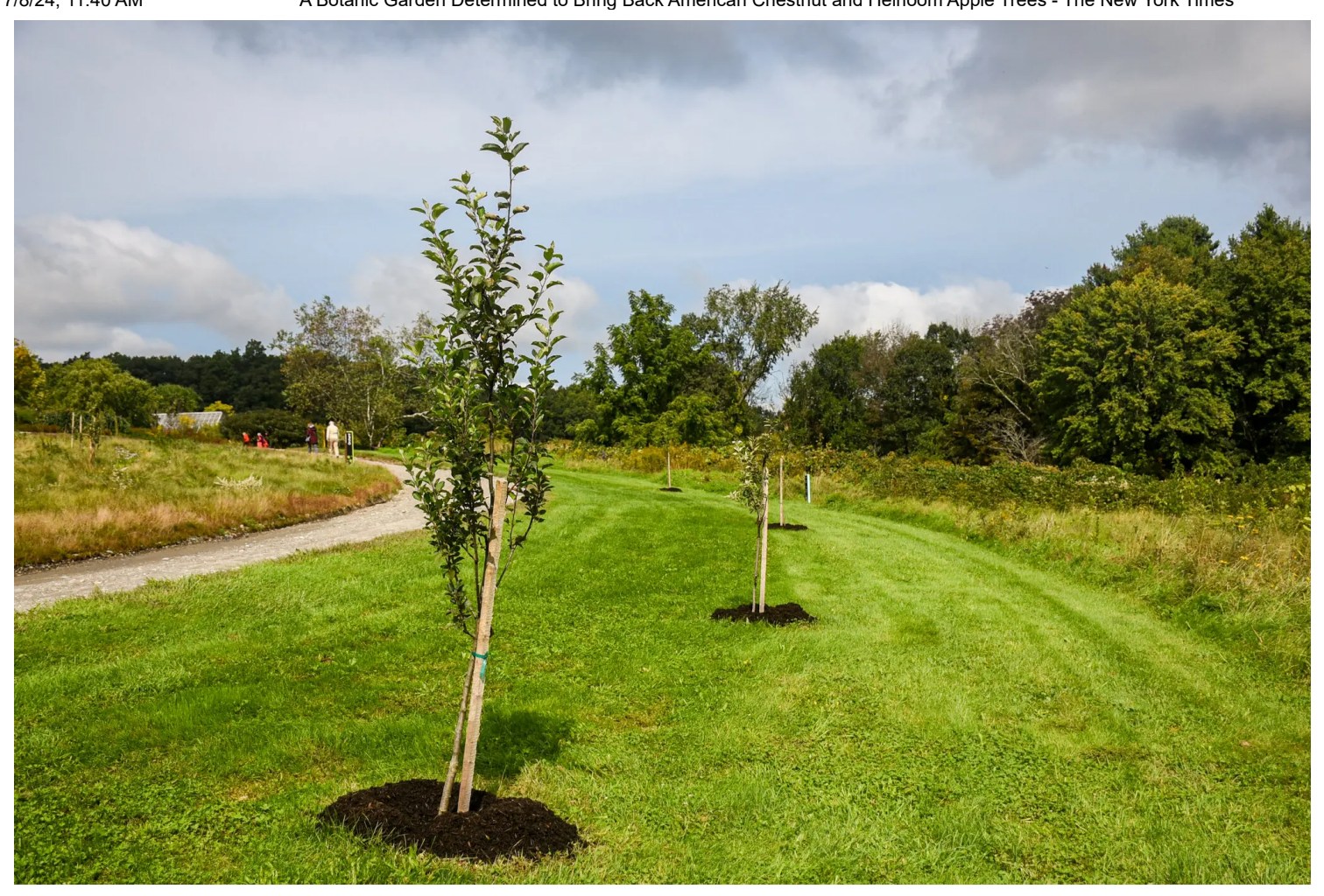
The replacement apple trees have a few years to go before they reach fruiting size.

The goal was 268 trees in all: two of every variety, one grafted onto each of two different semi-dwarf rootstocks, as well as a selection of 30 trees grafted onto standard rootstock, which would grow larger and live longer — 100 years or so — flanking key parts of the driveway to provide a proper welcome once again.