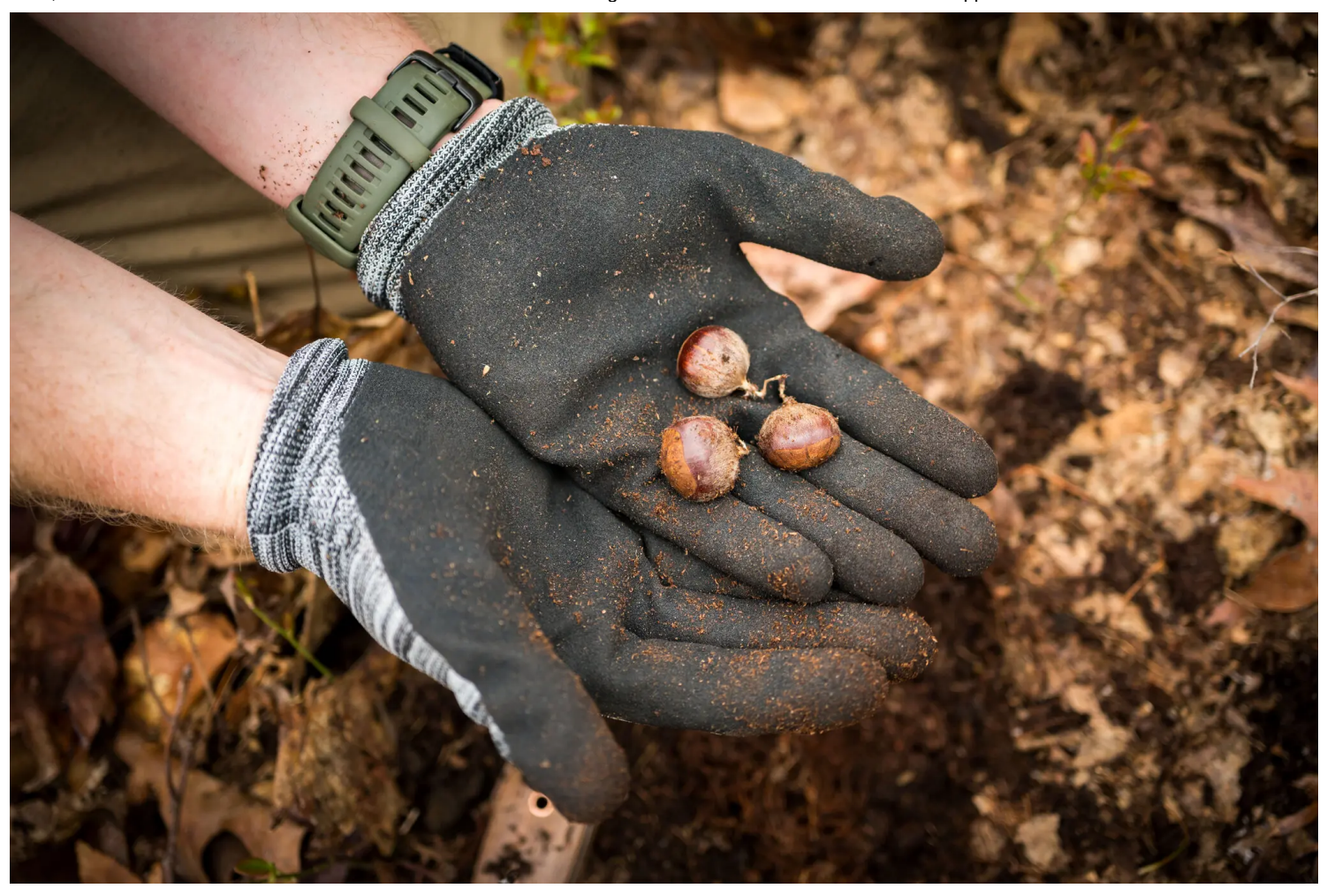
This spring, 160 chestnuts resulting from crosses made from large, standing American chestnut trees with natural blight resistance were planted at the botanic garden. Troy Thompson