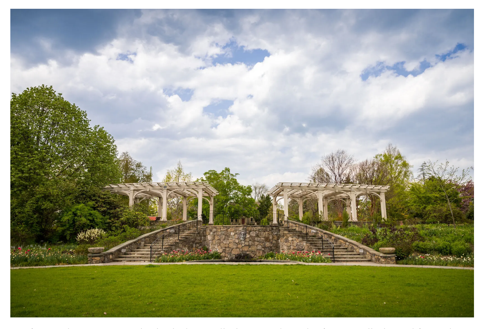
The Boylston, Mass., site includes 18 distinct gardens, both naturalistic and formal. The Secret Garden is tucked under grand twin staircases and pergolas.